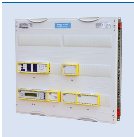
USC710D4-01-HA – Typical module

Control module with single fault tolerance for load switches or circuit breakers