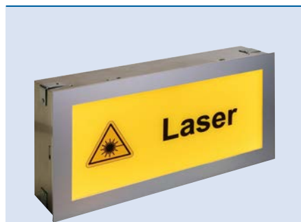
Flush-mounting enclosure with aluminium bezel frame