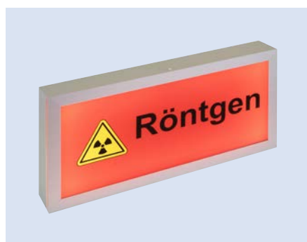
Surface mounted aluminium enclosure