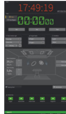
Clearly visible timer

Prevents unintentional operation of buttons and switches while cleaning the glass surface.