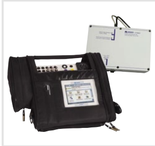
UNIMET® 810ST – 25 A Version The test system for manufacturers of medical devices