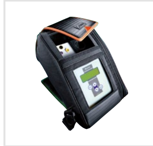
UNIMET® 400ST The lightweight version for mobile applications