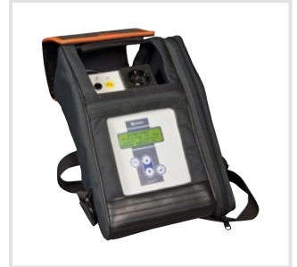
UNIMET® 300ST The test system for electric beds and electrical equipment in compliance with accident prevention regulations. (DGUV Vorschrift 3 Germany)