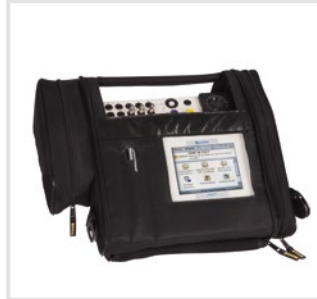
UNIMET® 810ST The test system for service purposes