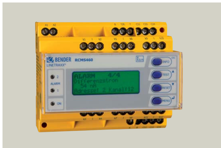
Figure One multi-channel residual current monitoring system RCMS

In the case of earthed systems, the insulation resistance is determined indirectly via the magnitude of the fault current. A classic tool for this purpose is the residual current device (RCD), which shuts down the system or the loads if a certain fault current is exceeded and in this way prevents a hazard. In areas in which a shutdown could be a problem for operations, e.g. IT systems, often residual current monitors (RCM) are used. These also operate based on the residual current principle that is the difference between the current flowing in and out is measured using a measuring current transformer and a signal provided or the system shut down at a specific fault current. Depending on the related fault current, AC, pulsed DC or AC/DC sensitive devices are used. For systems in which a large number of outgoing circuits need to be monitored, multiple channel systems are also available on the market, so-called RCMSs. RCMS must meet the requirements of the product standard DIN EN 62020 VDE 0663:2005-11. These devices are also used to monitor a "clean" TN-S system, i. e. strict separation of N and PE. In accordance with DIN VDE 0100-444 (VDE 0100-444):2010-10 section 444.4.3.2 a RCM can support the effectiveness of a TN-S system.