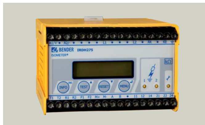
Figure 3: Insulation monitoring device ISOMETER® IRDH275 for variable-speed drives